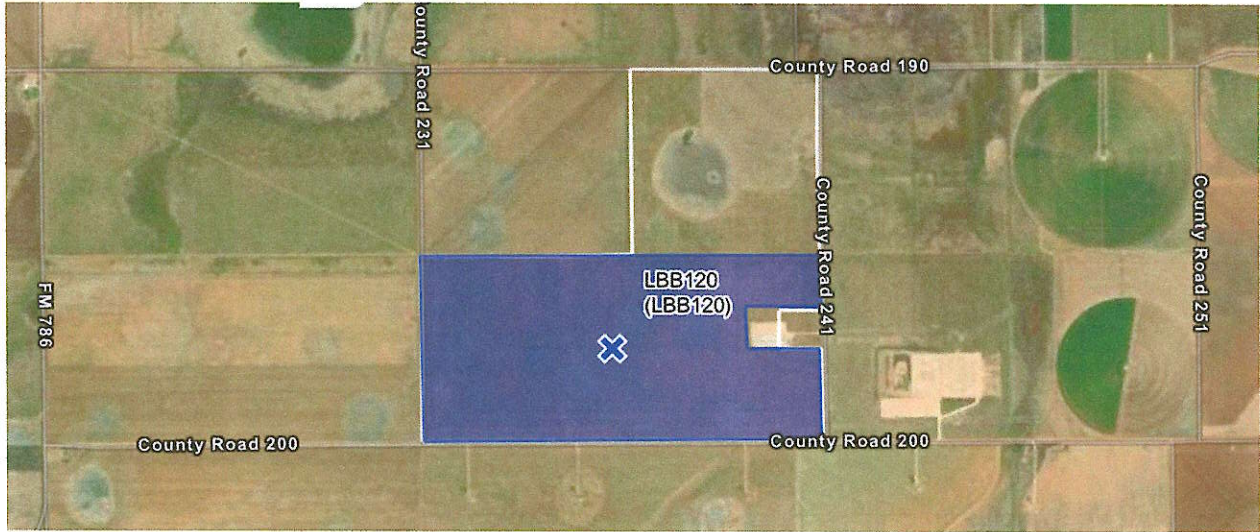
EXHIBIT A (CONTINUED) MAP OF AMAZON DATA SERVICES REINVESTMENT ZONE